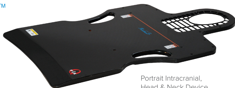
Portrait Intracranial, Head & Neck Device RT-4552